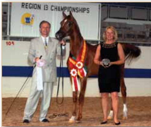
Left: GA Grand Odysseous (Odyssey SC x GA Mi Grandlady), a 2006 chestnut stallion, pictured in 2007 at Region 13 where he was named Reserve Champion Yearling Colt. He is now being trained in western pleasure and is headed back to the showing in 2011.