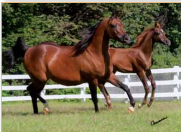
GA Mi Grandlady (Minotaur x WN Mahogany Lady by Padrons Mahogany) and her 2010 foal Mi Grand Valentino [pending] by DA Valentino.

Bottom right: GA Grand Geronimo (EVG Gentry x GA Bey Ane Versare by Bey Shah), a 2008 chestnut colt, brought in some fancy halter wins this year: a Class A championship, Region 13 Reserve Champion, and Canadian Top Ten.